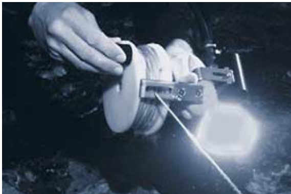
Diver reeling out

While a reel is employed each team member has specific duties.