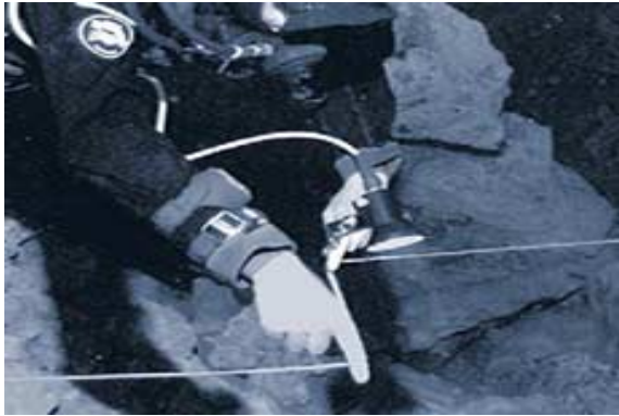
Diver helps by keeping tension on the line

together. For this reason, whenever a wrap is used, a lock should also be used. After some practice, a locking wrap can be fashioned before placing it by twisting the line in the hand. This can be done as the line is being installed, making the process smoother, cleaner and faster.